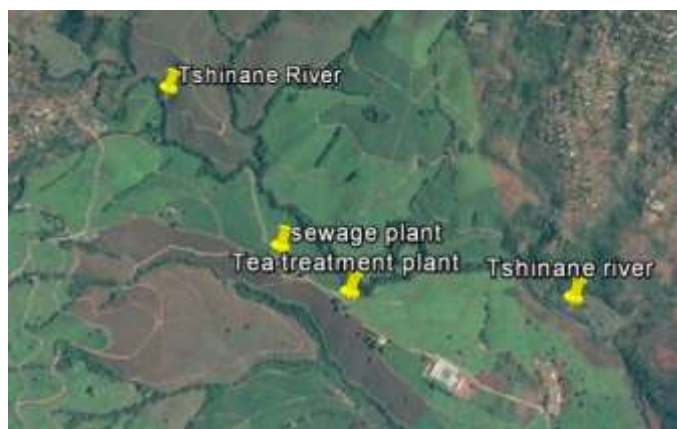
Fig 3: The location of the sewage plant and tea processing plant and Tshinane River

The phosphate and nitrate levels in the Tshinane River probable originate from anthropogenic and not from geological sources (Figure 3). The anthropogenic sources are probable from the discharge of black tea processing wastewater and discharge from sewage plant with regards to the nitrate levels and from commercial and subsistence farming operations. This may be true since the nitrate levels seem to increase downstream of Tshinane River. In separate study in the Luvuvhu River catchment it was shown that the nutrient enrichment was partly due to sewage discharge [11]. This study is in agreement with the study of Han et al. [12] in China that nitrate from a tea plantation was the source of nitrate in their environment.