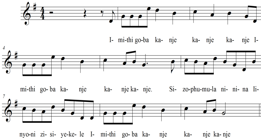
Figure 2. Imithi goba kanje