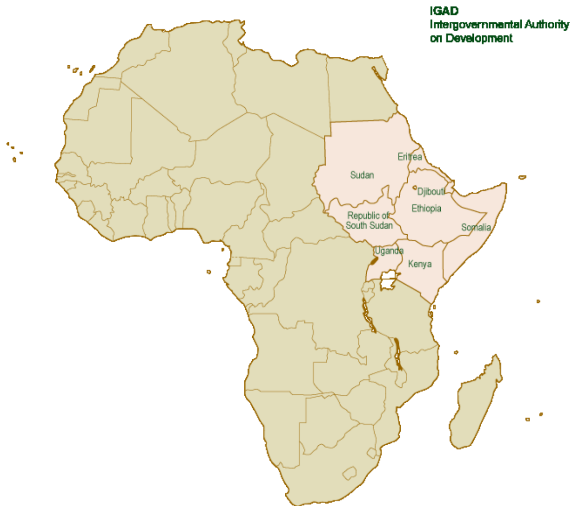
Figure 2.3. Member states of IGAD