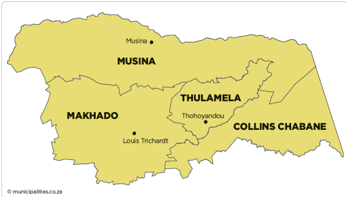
Figure 3.1. Map of Vhembe District (Vhembe District Municipality) (2017)

Tshaulu has 68 police officers, 64 per cent of them are males and 26 per cent are females; Mutale has 120 police officers and 72 per cent of them are males and 28 per cent are females while Vuwani police station has 125 police officers of whom 66 per cent are males and 34 per cent are females.