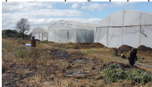
Figure.4. The use of translucent UV-resistant polyethylene film can help in reducing atmospheric contamination and pollution and control of inside air temperatures

Physical contamination: The open Spirulina production systems are prone to atmospheric pollution and contamination with insects, birds (feathers) and their droppings, plastics, soot and smoke particles (Grobbelaar, 2003). Also the freshwater attract aquatic insects such as Ephydriidae (brine flies), Corixidae (water boatmen) and Chironomidae (midges) (Grobbelaar, 2003). However by covering the open Spirulina production systems with clear 0.15 mm-thick translucent UV-resistant polyethylene film can help in reducing atmospheric contamination and pollution (Habib, 2008). These plastic covers will allow the entry of sunlight energy reduce the presence of aquatic insects and allow a control of air temperature, thus improving the quality of Spirulina (Figure 4).