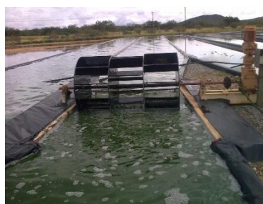
Figure.2. Static bioreactors and growth conditions

The cultivation of Spirulina in open channel raceway bioreactors in Musina, Limpopo, South Africa (Figure.3). The use of mixotrophic and heterotrophic nutrition based on organic substrates of the Arthrospira species leads higher biomass and productivity in comparison with autotrophic nutrition. The up-scaling of mixotrophic and heterotrophic modes of nutrition is expensive due to the cost in purchasing of organic substrates and microbiological contamination of Arthrospira species, partly due to presence of fungi and bacteria that may out-compete the Arthrospira species in the utilization of organic substrate (Grewe & Pulz, 2012).