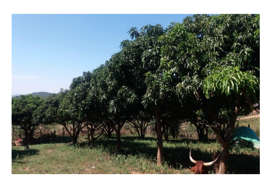
Figure 6.20 Fruit Trees