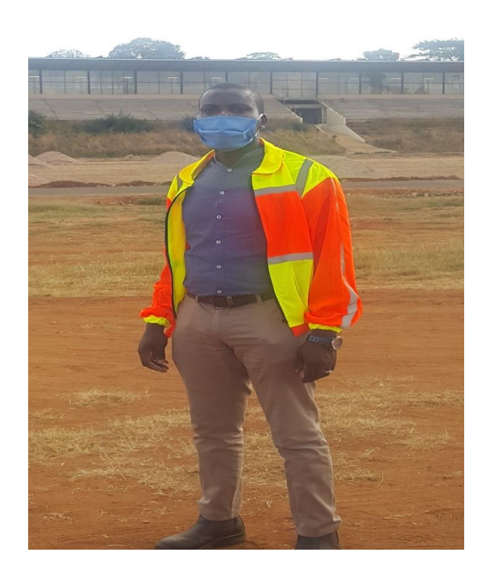
Figure 5.3: Picture showing Personal Protective Equipment (PPE) compliance on site

relationship. The researcher also complied with the safety regulations on site. In doing so he also wore the safety boots and reflectors as shown in the picture below.