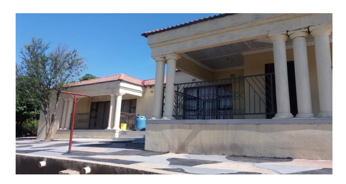
Figure 6.12 A Modern House in The Communal Areas Under Study