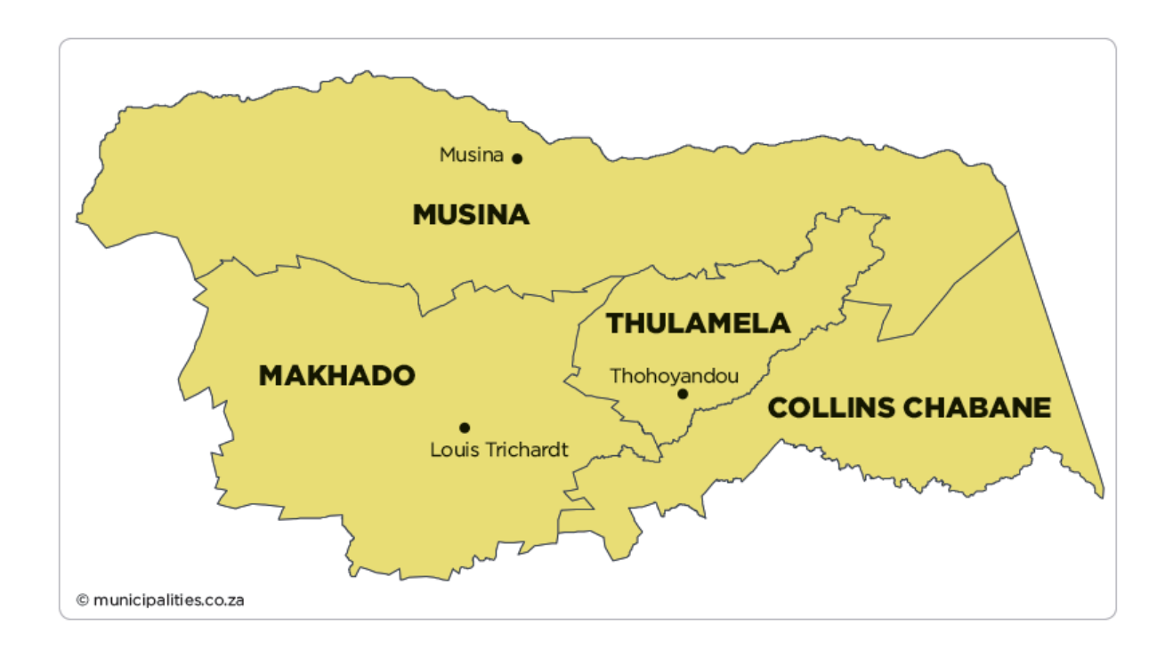
Figure 5.2: Map of Vhembe District

such, the study was in three areas under Vhembe district; Vondo, Thathe and Makwarela. The map below shows the study area