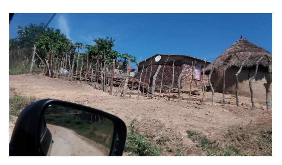
Figure 6.11 Thatched Kitchen