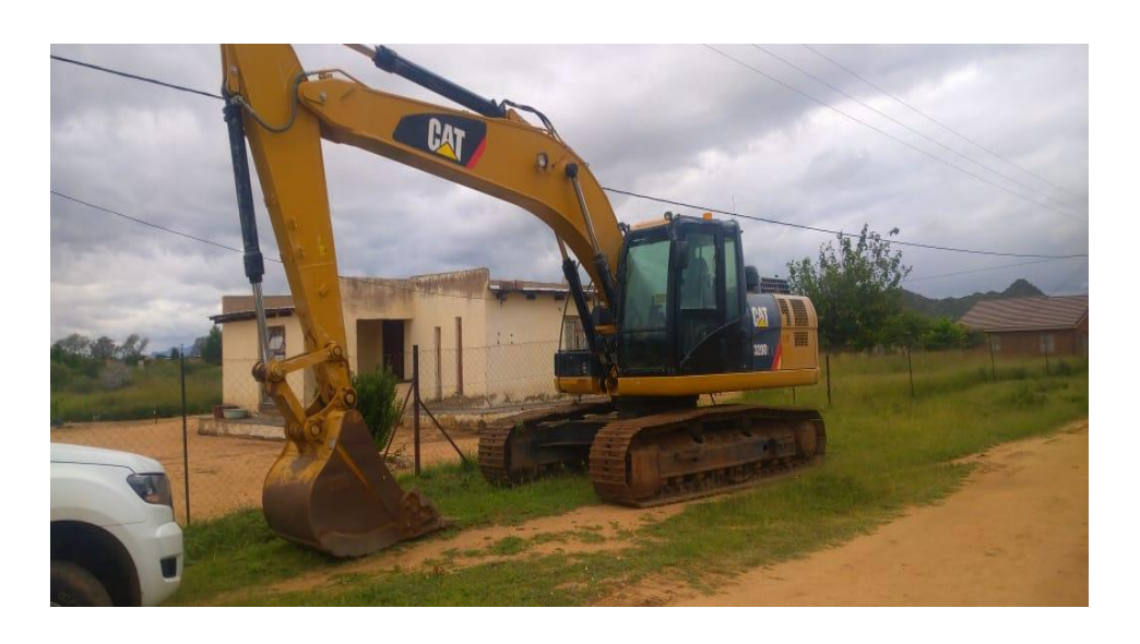
Figure 6.4 Shows The Bulldozer Referred to by the Responded Above