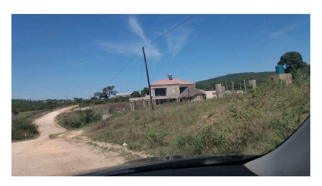
Figure 6.13 Electricity Poles