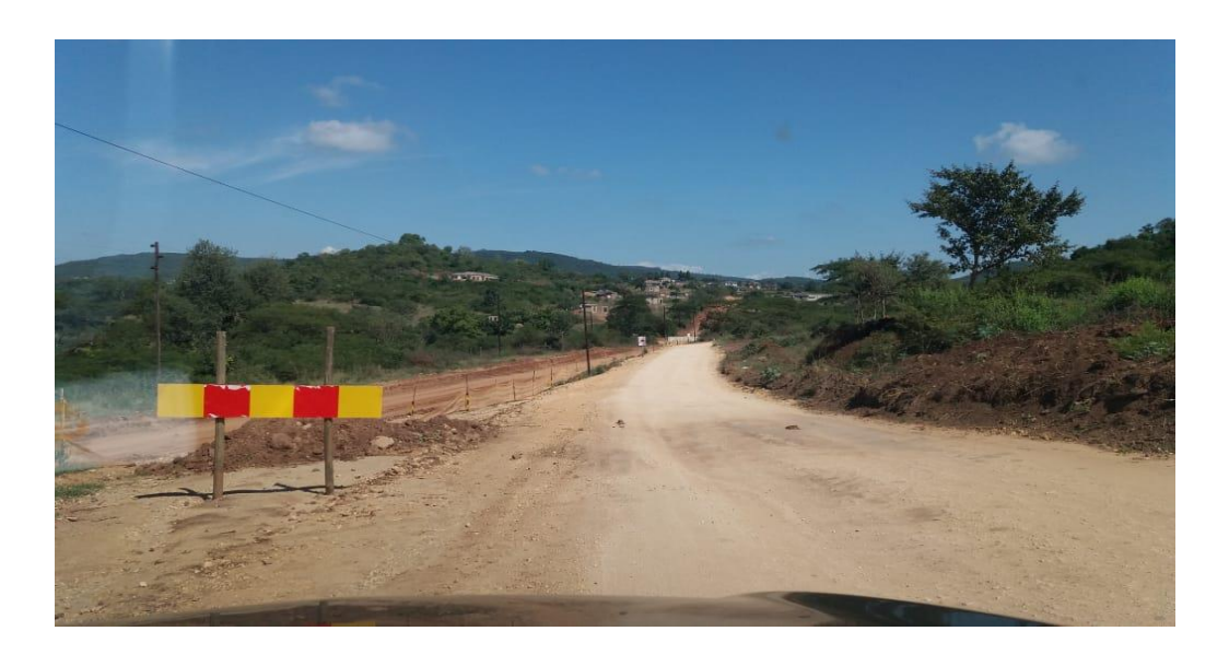
Figure 6.7Construction of a Tarmac Road in the Village