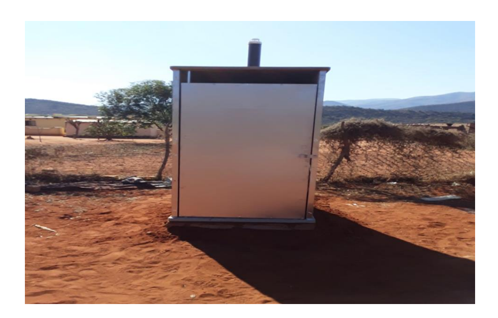
Figure 6.19 Picture of a Completed Latrine Structure