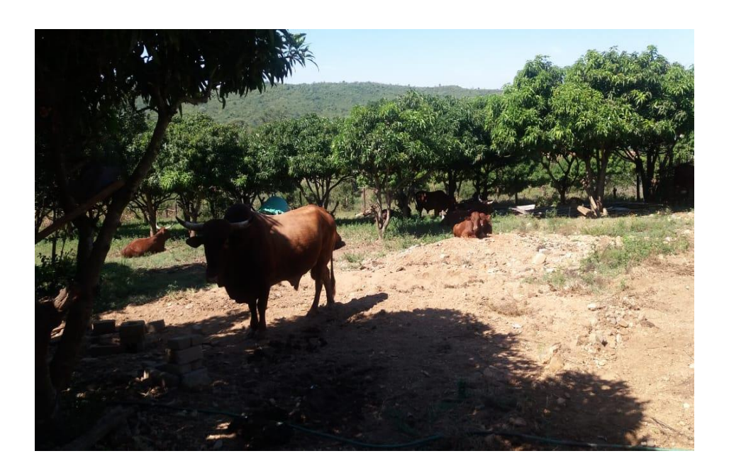
Figure 6.21 Cattle