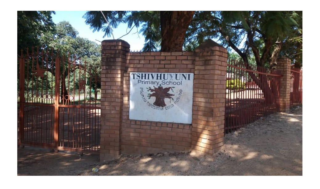
Figure 6.14 Name of The School

Notwithstanding these investments at a family level, the participants likewise told the researcher that others have additionally occurred at the community level. These are similarly great. Over the study sites, schools, places of worship, markets and different structures have been assembled. The participants demonstrated that the endeavours in building the schools and all the aforesaid infrastructure sanctions the security that is implanted in communal land rights. These investments are considerably progressively hard to assess, however are huge, and again proof of the responsibility of communal people and government structures to improving their territories paying little mind to the supposed tenure insecurity. Below is figure 6.14 and 6.15 showing one of the schools in Vhembe district.