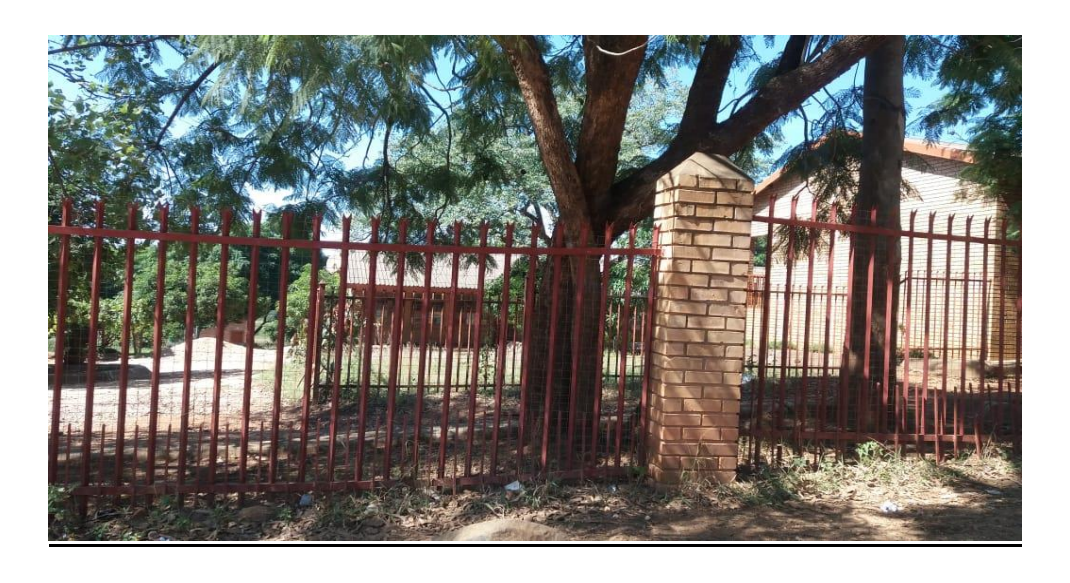
Figure 6.15 Tshivhuyuni Primary School