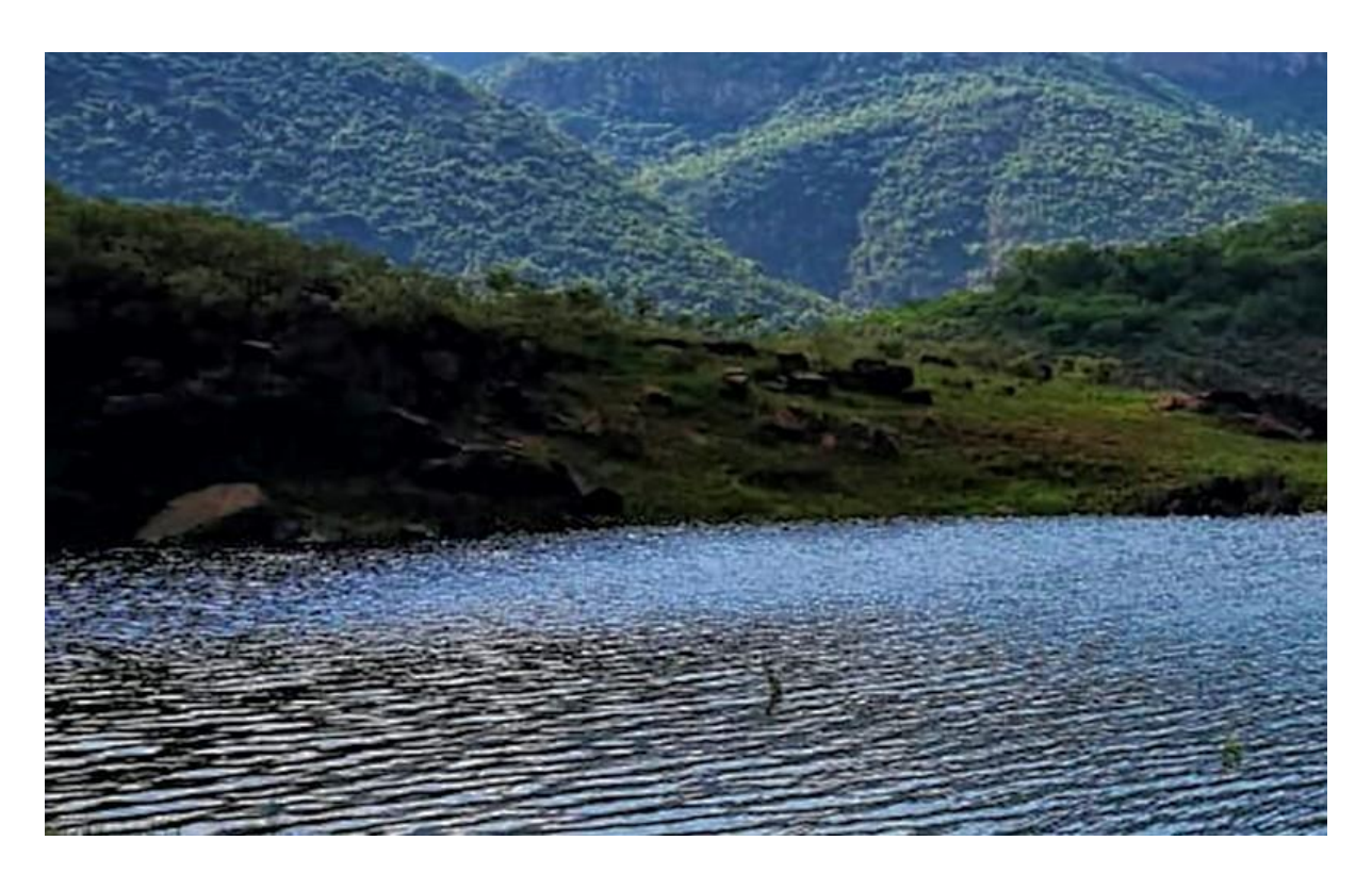
Figure 6.8 Lake Fundudzi

Province. The Lake is located in Vhembe District Municipality. Under the Vhembe District Municipality are four Local muncipalities of Musina; Collins Chabane; Makhado and Thulamela. Lake Fundudzi exists in Thulamela Local Municipality. Lake Fundudzi is located in the Southpansburg range of mountains. The lake measures 5 km in length and 3 km in width when full, normally after the seasonal rains (Rogerson, 2017). The southern half of Lake Fundudzi was a wetland. Below in figure 6.8 is a picture which showed Lake Fundudzi.