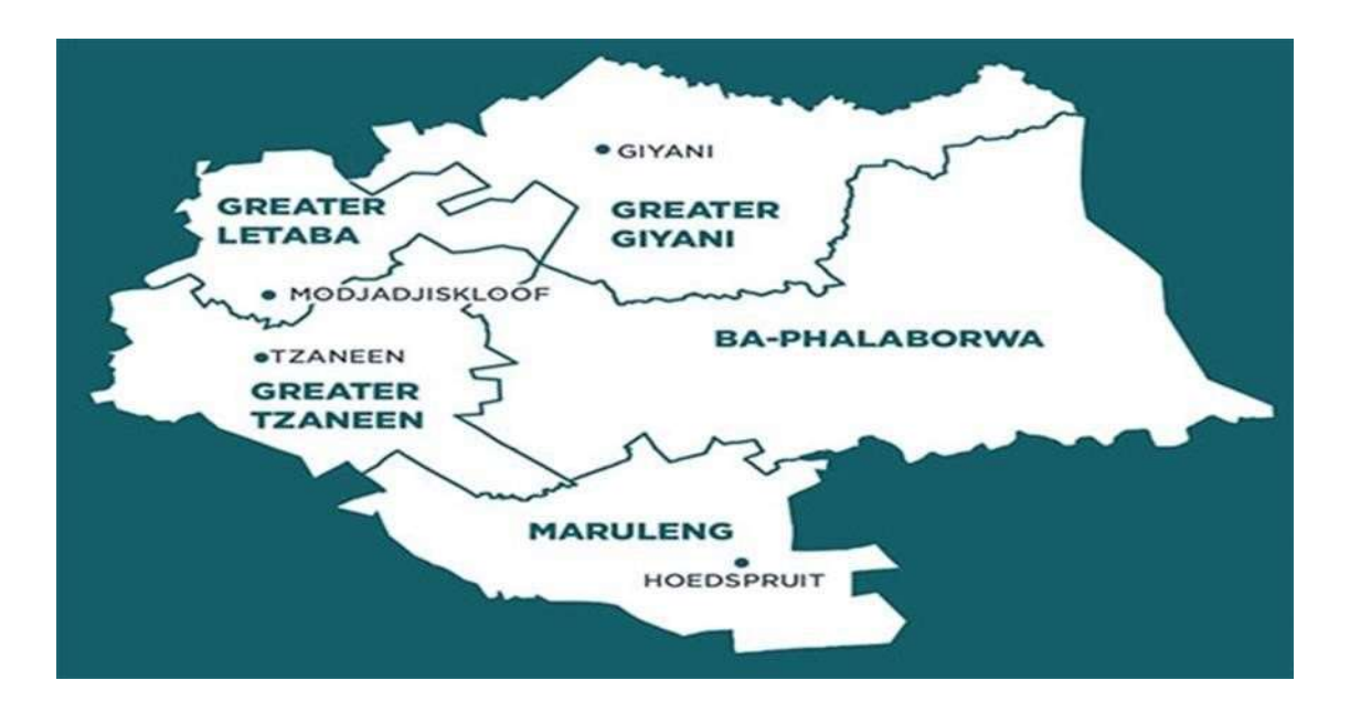
Figure 3.2: Map indicating study areas in Mopani District.