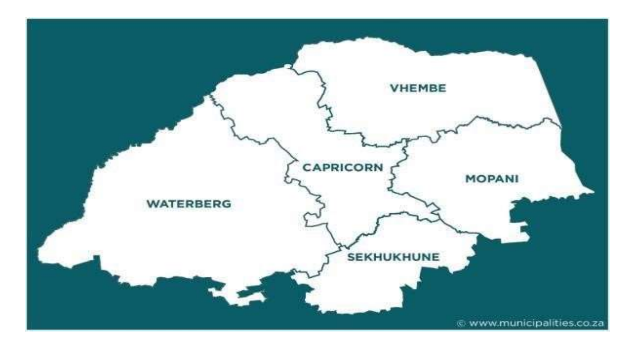
Figure 3.1: Map showing Limpopo District municipalities