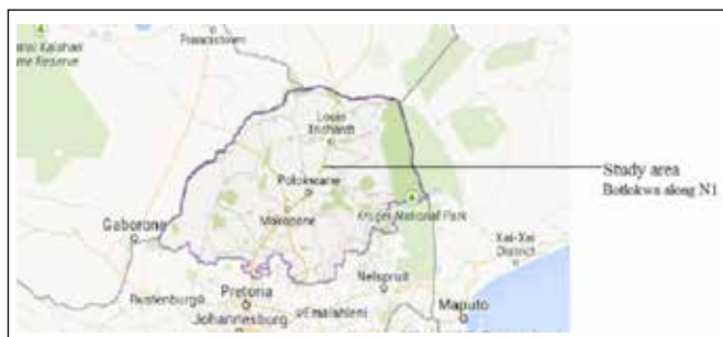
Fig. 1. Location map of Limpopo province showing Botlokwa area where the Tropic of Capricorn passes ( https://maps.google.co.za/maps . Accessed 22/10/2014).

Morphologically, this species and most other plants found along the Tropic of Capricorn were observed to have a significantly reduced height, but moving to the sub-tropical and tropical regions, plants gradually increased in height. As a result, a ‘U’ shaped format of plants is observed. It was then assumed that most of these plants along the Tropic of Capricorn, including V. tortilis , may be influenced by the environmental pattern. Other influencing forces might be the alleged underground force ley lines, energy vortex and portals lines, which often run either under megaliths such as Stonehenge in England or Monoliths in the case of South Africa.