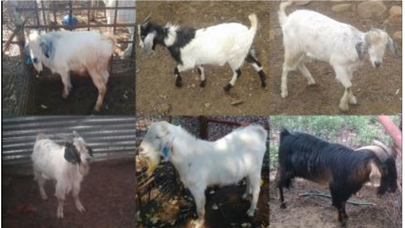
Figure 3.1: The South African indigenous bucks that were used as semen donors