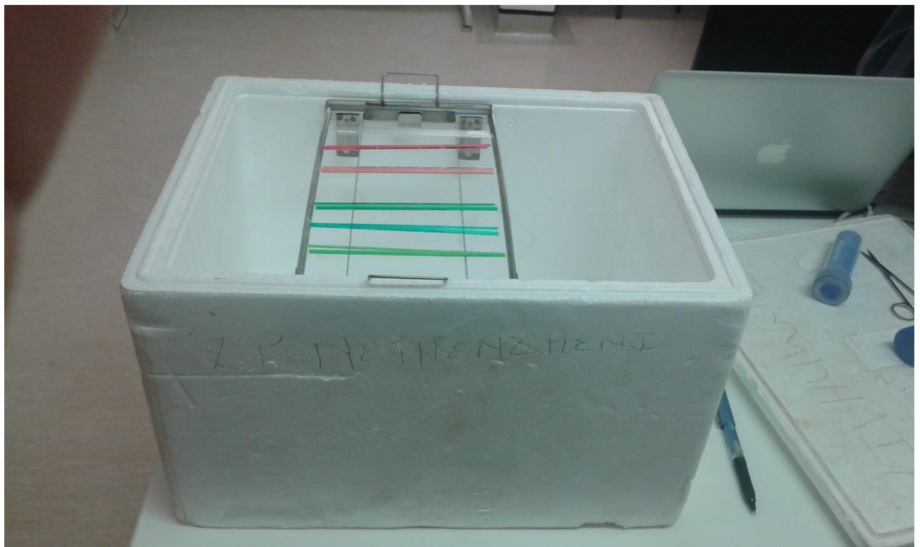
Figure 3.4: Polystyrene box, straw holding rack, and semen straws for semen cryopreservation