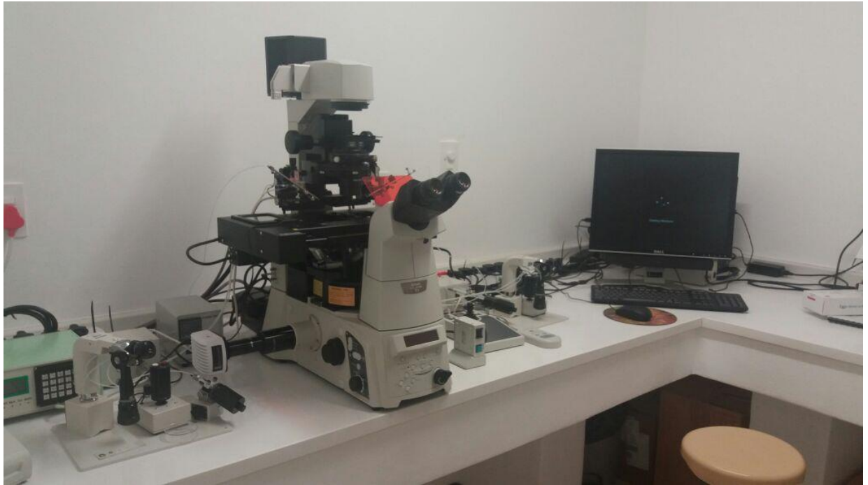
Figure 3.3: Used UV light inverted microscope for evaluation of the spermatozoa chromatin and mitochondrial membrane potential